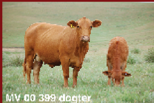
MV 00 399 dogter