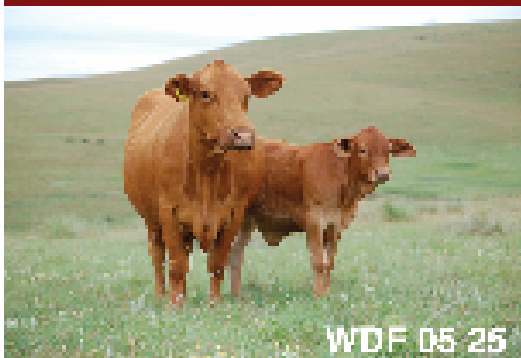
WDF 05 25

Benefits of the merger • Greater Numbers • Greater Selection • More Mountains • Better testing • Greater Input • Clearer Vision