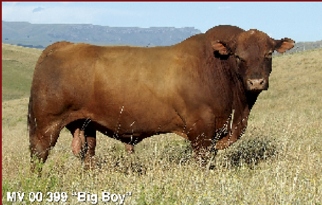
MV 00 399 "Big Boy"

White Bank Farms and Triple A Estates have merged